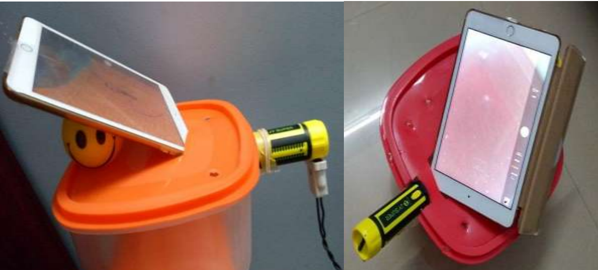
Figure 2. I pad is placed and stabilized well over stress ball or mobile phone holder and seated in to the trainer.

The camera focus and as well as light is projected from the same end of the box The Shadows aid in depth perception like in the arrangement of 2D laparoscopy .Good vision and clarity is available in I pad mini. Plastic box with lid made of pliable material is suitable for ports and maneuvering the instruments through it.