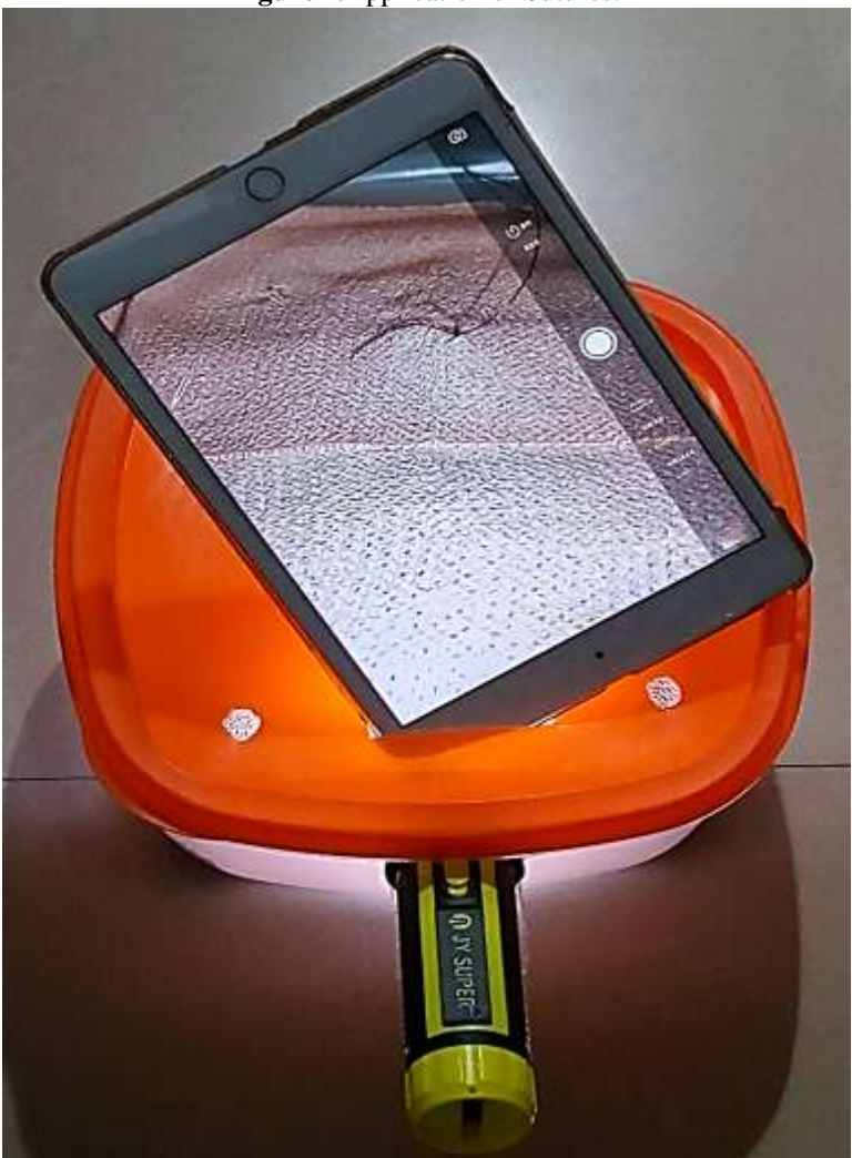
Figure 4:Out look- IPadBox Lap Endo Trainer V. Conclusion

With the surgical future transcends to new dimensions of minimal access surgery these kind of devices shall enable all the medical professionals begin to learn and acquire the basic skills as a part of fundamental learning in medical Schools.