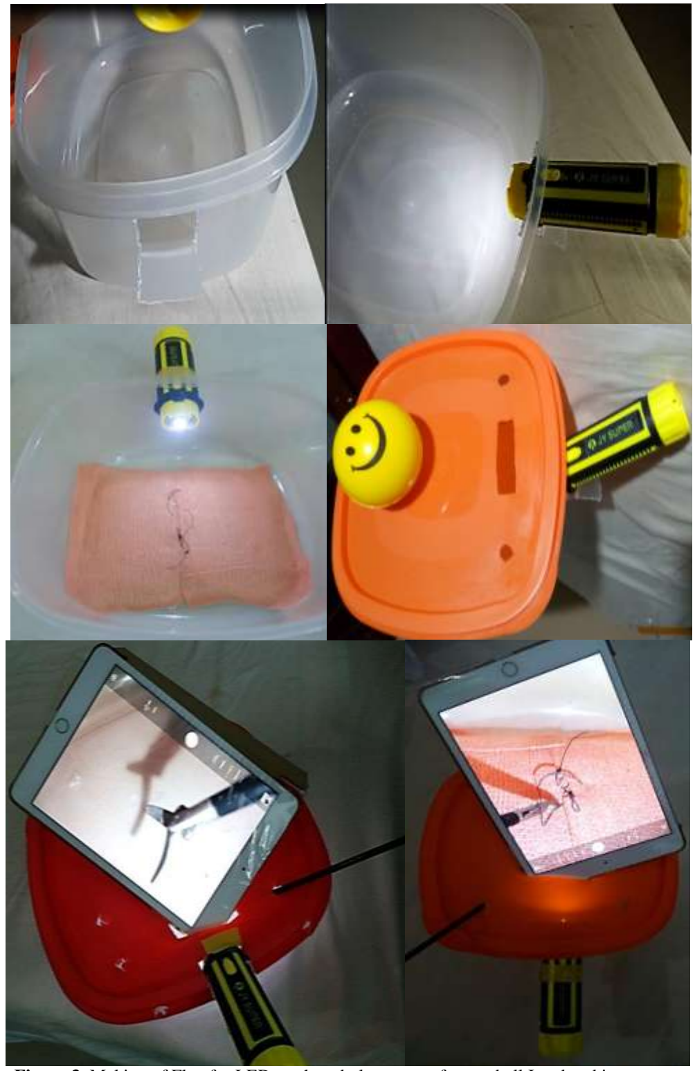
Figure 3. Making of Flap for LED torch and placement of stress ball, I pad and instrument